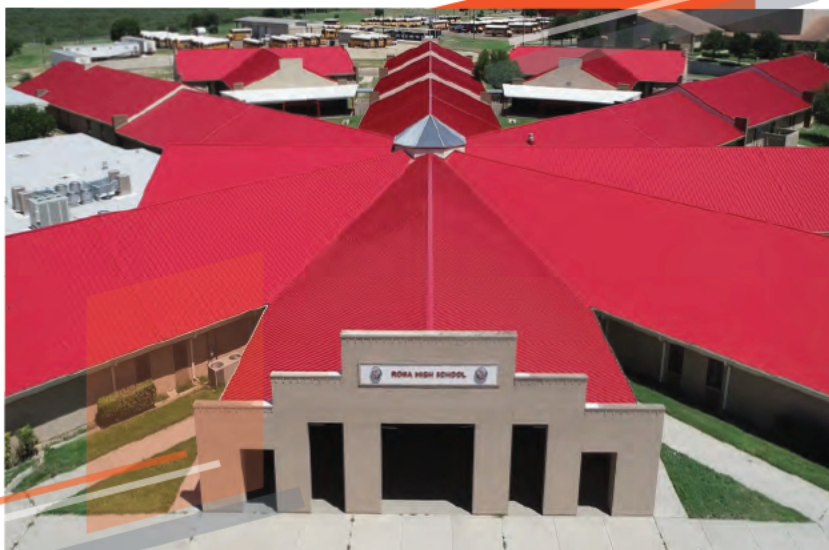
Rio Roofing Panel Profile: McElroy Metal 138T Job Site Location: LOUISIANA, USA Job Size: 233,335 square feet

Zack Kilwein, Owner of Beartooth Metal Roofing