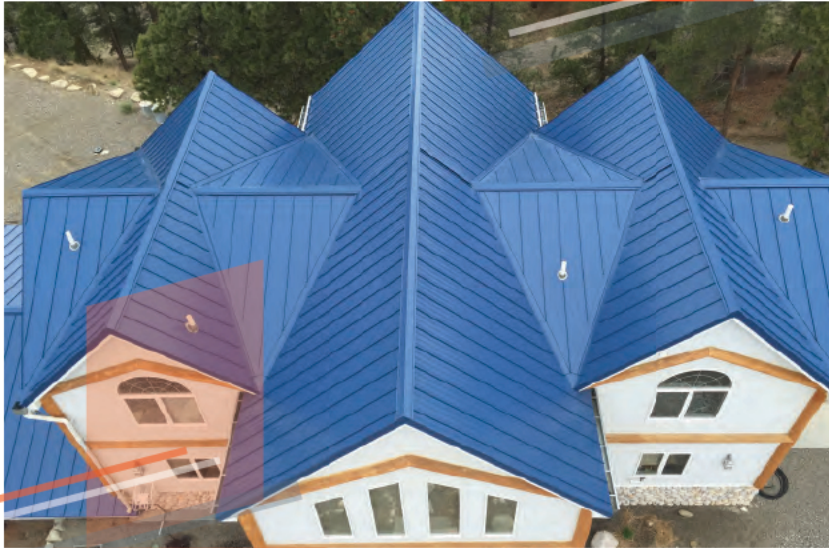
Beartooth Metal Roofing Panel Profile: New Tech Machinery, 1" Nail Strip Job Site Location: MONTANA, USA Job Size: 520 square feet

"The SnapTable PRO increased our valley production three-fold. It was nice to have a machine that could produce perfect valley bends longer than your average hand tool. My SnapTable PRO has allowed me to prep high-quality panels at a much quicker rate. I've had my machine for several years now, and I wouldn't go to a job site without it!"